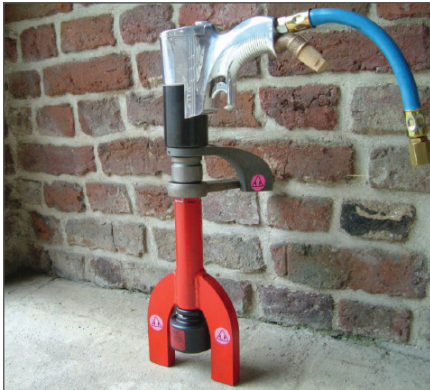
JOB SPECIFIC EXTENSIONS

We will work together with you to develop a faster, easier or safer solution for any bolting issues you may have.